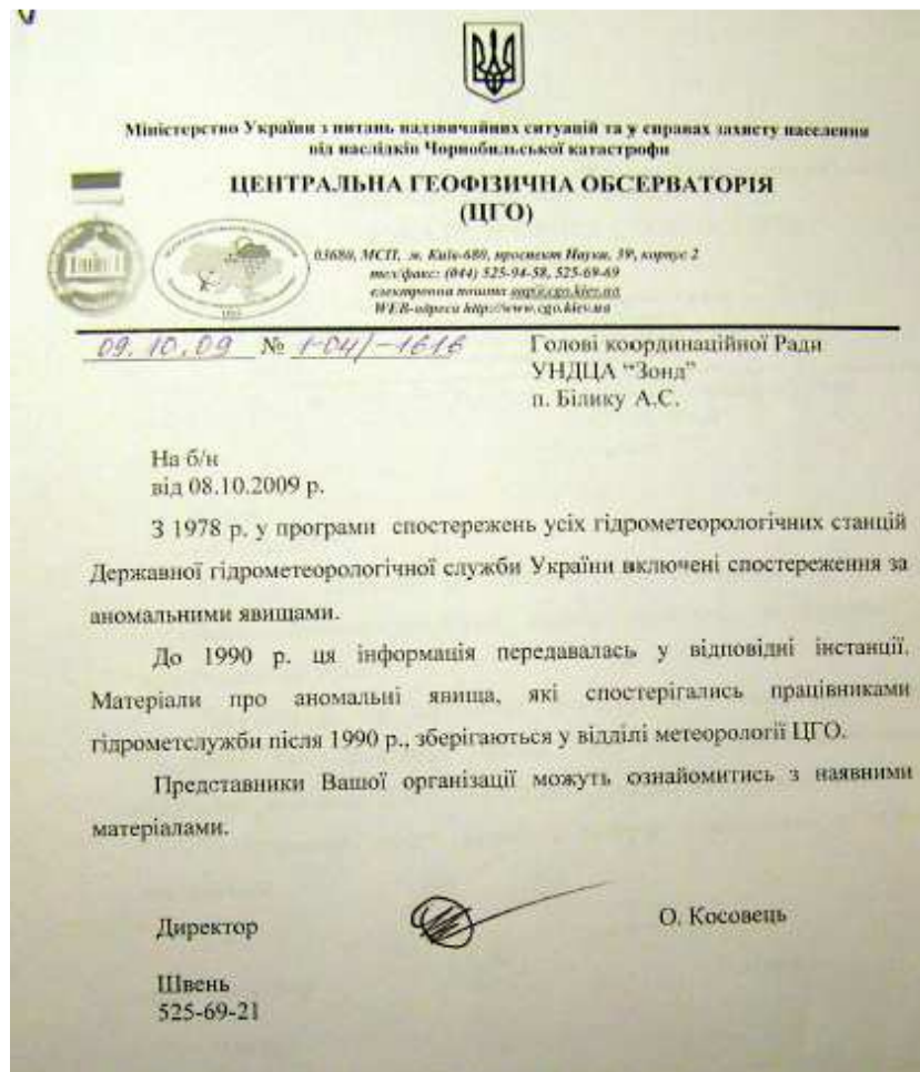
Fig.3. Since 1978 all meteorological stations of Ukraine State Hydrometeorological Service includes part in the program of anomalous phenomena observations